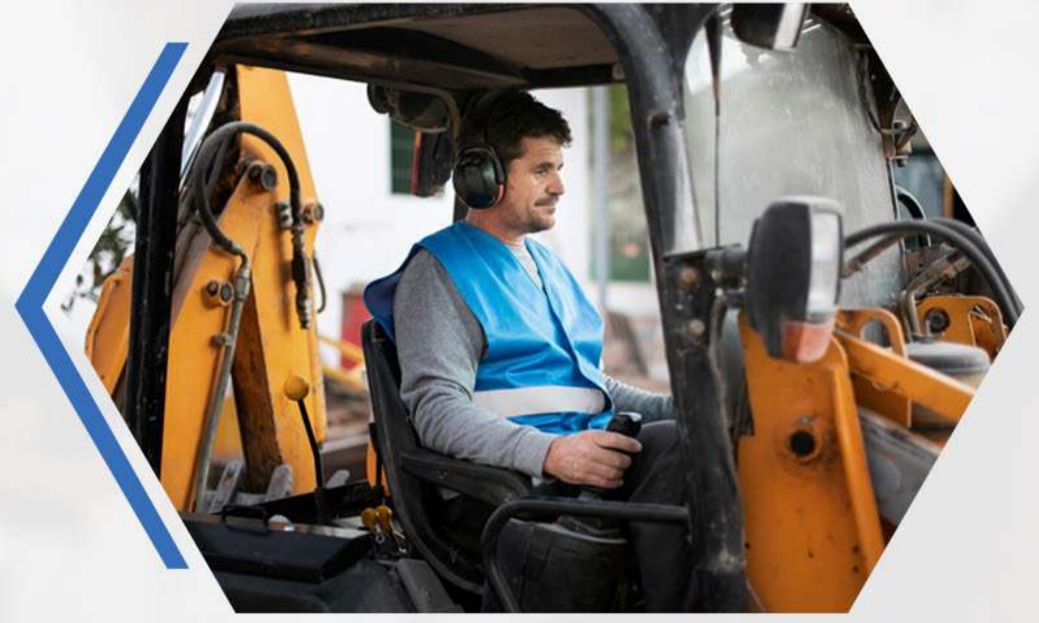
Vehicle & Heavy Equipment Operators