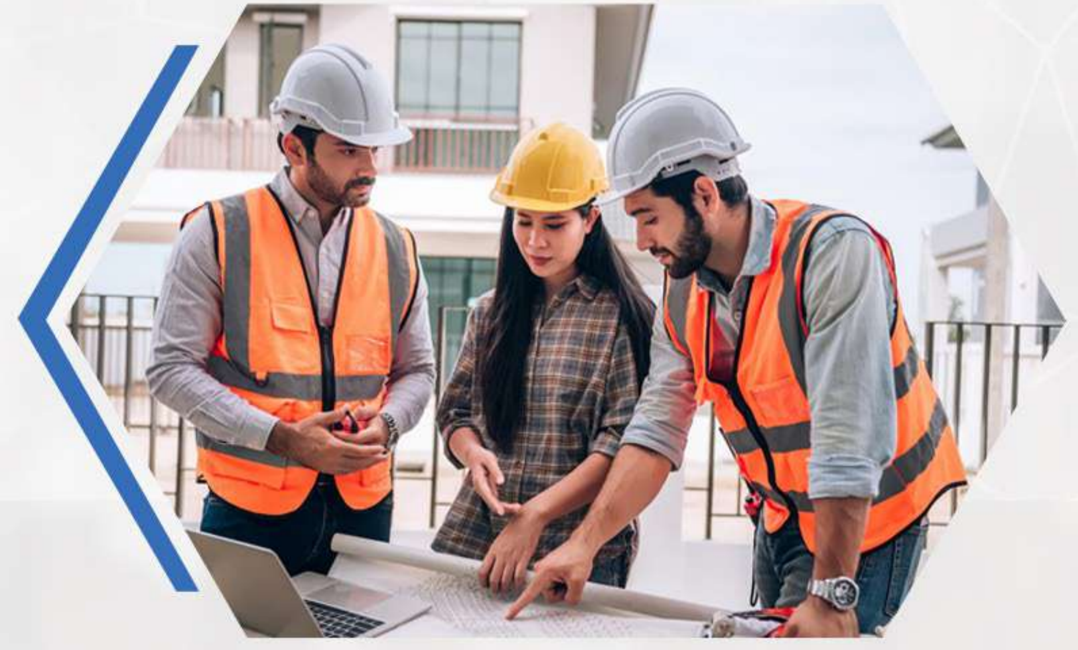
Construction & Engineering